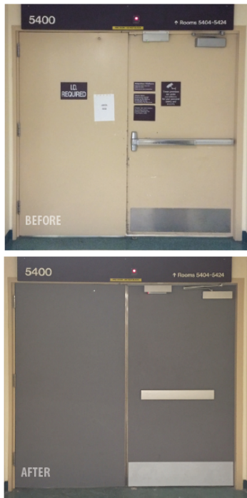
The most versatile door for your toughest Retro-fit Applications